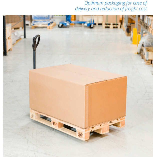
Optimum packaging for ease of delivery and reduction of freight cost