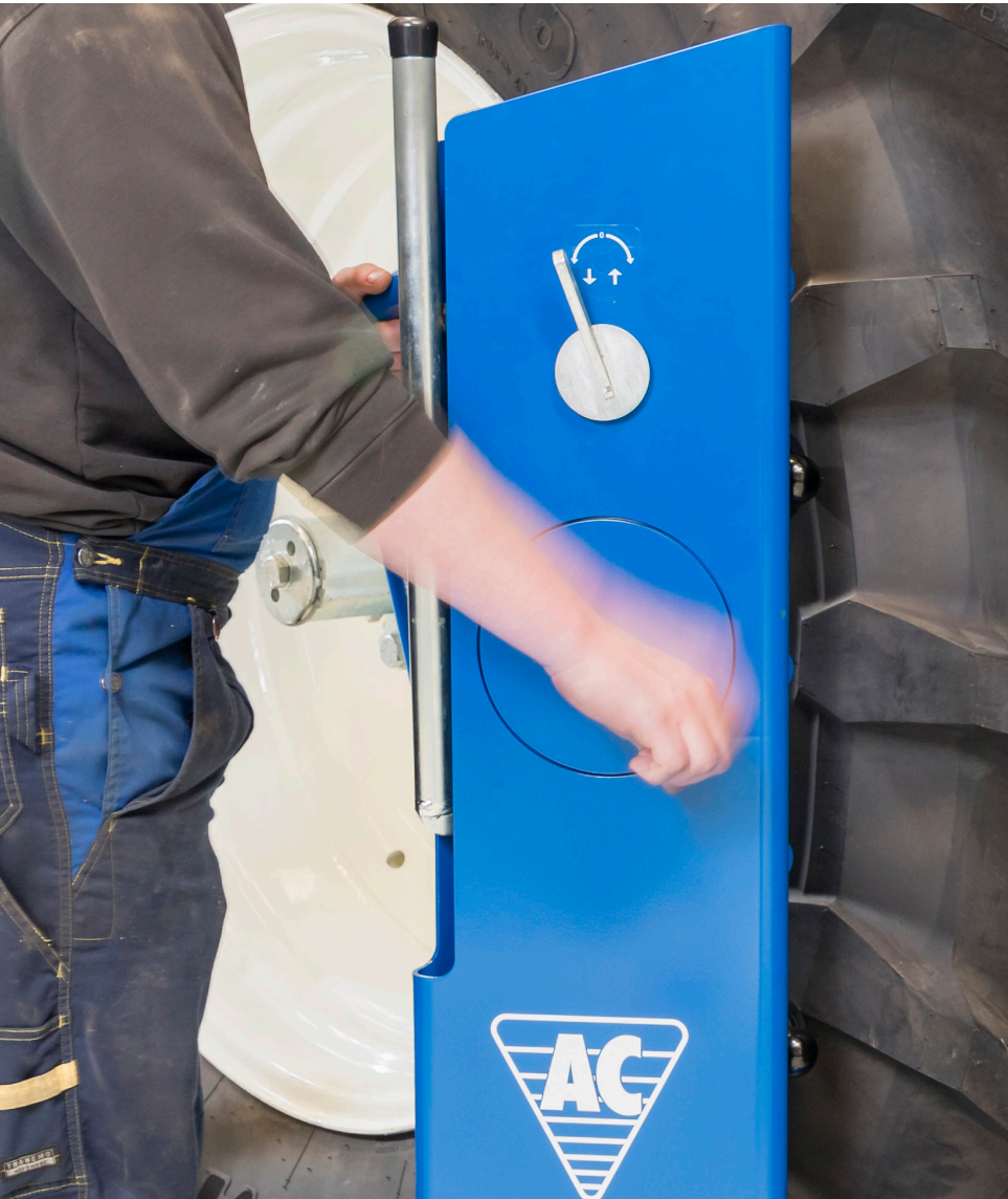
Rotate the wheel to align the studs perfectly when re-fitting the wheel